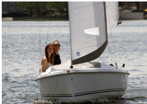
Wide beam for safety and stability