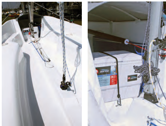
Roomy, Comfortable Cockpit with Standard Cuddy Cooler